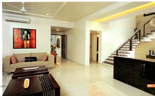
■ Art work and carefully chosen accessories help create the desired ambience for this contemporary home. The staircase, with its wooden mesh and SS railing, further augments