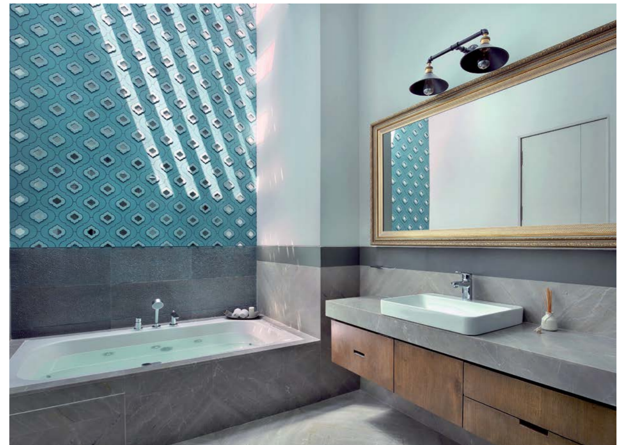
Located on the top floor, the bath in Katni marble and kota stone offers the soothing ambience and facilities of a luxurious spa. The aqua wall was laser cut in Nu-Wood and adorned with mirrors. Left In the functional master bedroom with engineered wood flooring, the bed in Good Earth linen, features an entire partition as the backrest with engravings again taking cues from SH Raza's paintings

The house is richly layered and textured with a judicious mix of custom furniture, furnishings and artworks. The main passageway opens up into a seamless space for all the rooms on the ground level, opening into the deck that overlooks the garden with lots of trees. Each of the boudoirs allows sufficient cross-ventilation and natural light throughout. While the stark white walls in the various spaces are punctuated occasionally by bright colours, the materials used for the flooring were mostly Ambaji white marble, Italian marble, kota and wood. ♦