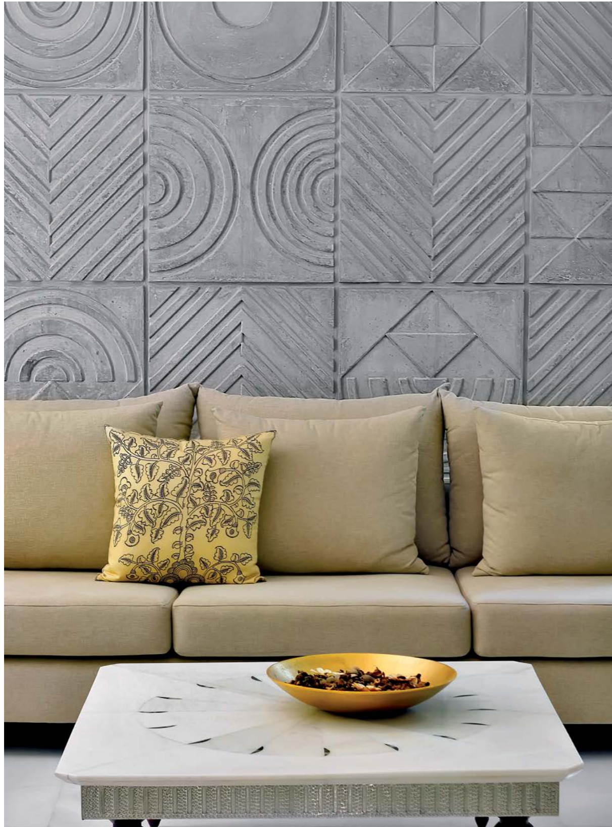
In the drawing room, patterns from SH Raza's Bindu and Tribhuj reflect on the grey concrete wall and custom marble centre table with mother of pearl inlay. The sofas were also specially created for this space Right The exposed concrete staircase features steps in teakwood. The wall adjacent to this stairwell has hollow pinball flappers to expose a full grown fig tree and other vegetation outside. Above, the industrial lamps offer soft ambient lighting at night