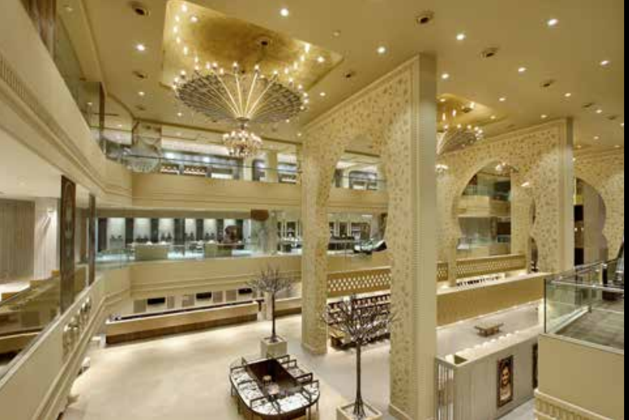
There are two shops on either side of the mall and the showroom entrance is from the centre of the mall. The showroom offers very cozy yet a welcoming foyer.

Custom made chandelier define the central space. The general wall display has evenly spread lights dispersing equal focus on each counter and hence each product.