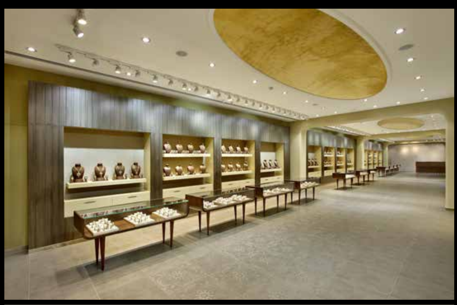
Certain areas are highlighted with beautiful carpeting whereas some areas have been rendered by tiles with galicha design.