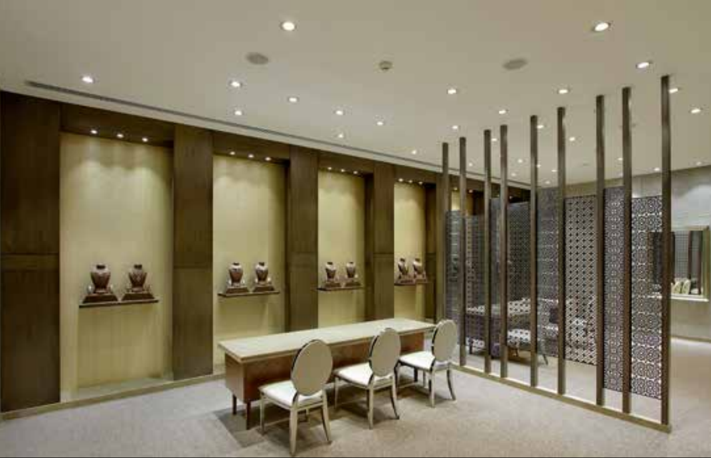
Custom designed metal jaalis are used as partition between spaces creating a dramatic effect.