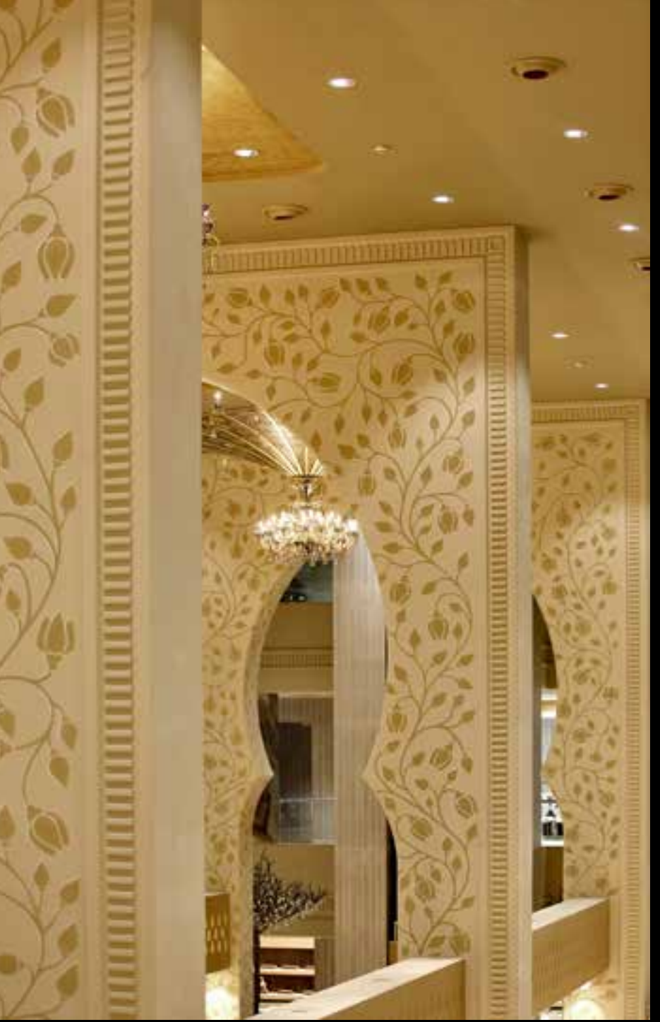
The arches add a royal touch to the interiors, imparting a sense of grandeur to the space and making the it seem larger.

Grand posters of models endorsing jewelry are seen all around. Despite being large in size, these visuals and graphics do not overpower the design elements and aesthetics of the showroom.