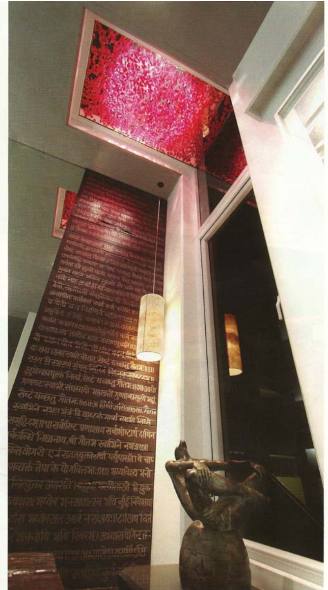
AUGUST 2010 HOME REVIEW 71