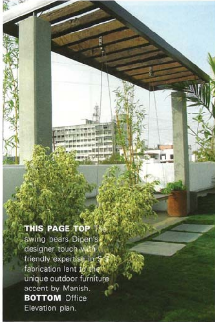
THIS PAGE TOP The Swing bears Dipen's designer touch with friendly expertise in S fabrication lent to the unique outdoor furniture accent by Manish. BOTTOM Office Elevation plan.

and workspace segregation according to personal research based needs for the designer's own office.