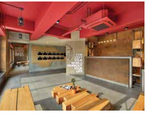
Fact File City Vadodara, Gujarat Built-up area 5,500sqft Year of completion 2016