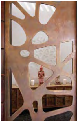
Each area is well connected with the outdoors and there is perfect communication between the public and private areas of the house.

The Amins had initially approached Dipen Gada & Associates to design a three bedroom weekend house on the outskirts of Vadodara, on a 65,000 sq ft plot surrounded by lots of greenery.