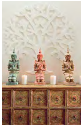
The walkway to the house which floats on a water body, leads one to the entrance foyer where an antique wooden chest with three welcoming statues stands in attendance. A tree motif on the rough wall creates a wonderful backdrop.