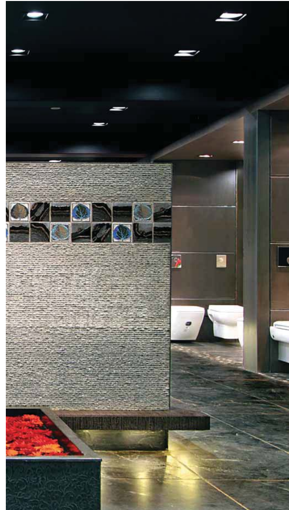
MAY-JUNE 2012 • DESIGN MATRIX 39

A retail showroom has two main functions – one to cater to the demands of the customer and second to play on the product to increase customers demand. When this demand is taken a step ahead and there is a synchronized collaboration between the product and the design then it results in the design concept of The Bath World. Located in Vadodara, The Bath World is one of the most renowned and reputed sanitary ware and tile showroom in Gujarat. Keeping this in mind, the design team was determined to ensure that this retail/display space for sanitary ware, Philips lighting, tiles and artwork would be completely different from the run-of-the-mill showrooms with bright lights and rows upon rows of products.