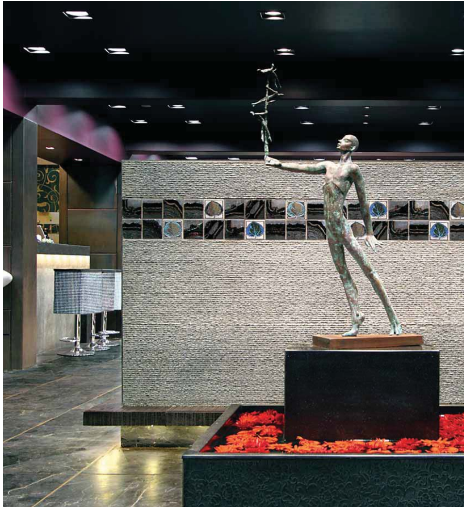
38 DESIGN MATRIX • MAY-JUNE 2012